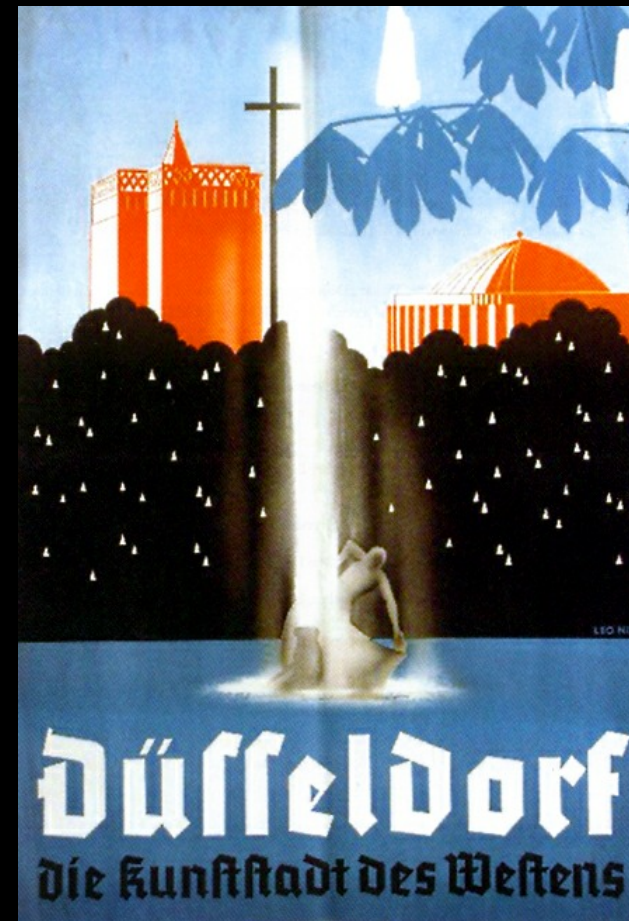
Düsseldorf 1938 official poster.