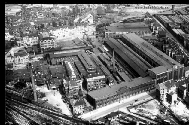
Schieß-DeFries Co. in Düsseldorf.