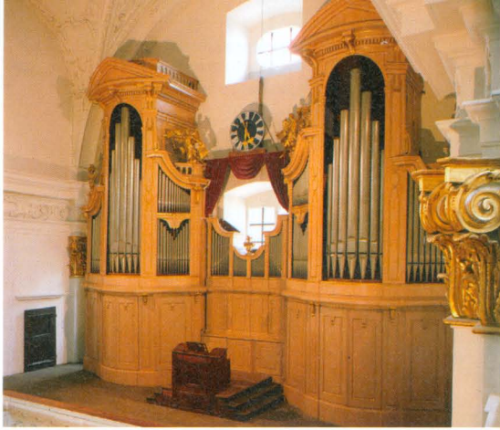
The Bruckner Organ in the Old Cathedral in Linz