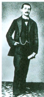
Anton Bruckner. Photograph 1854

as a schoolteacher, and for five of these he was also provisional organist in the monastery church. This was a period when he engaged profoundly with the musical tradition of his forbears, a study which bore fruit in the Missa solemnis in B flat Minor (WAB 29).