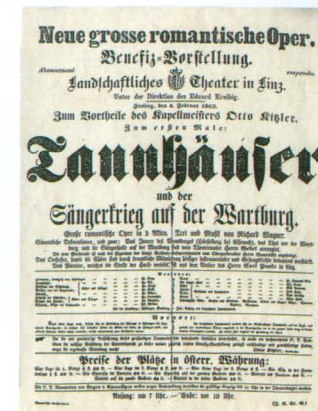
Richard Wagner's Tannhäuser in Linz (Poster)