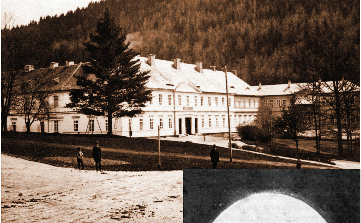
1872 - Marienbad : The Old Bath-House at Nummer 1 (later called the Central Bath-House) .