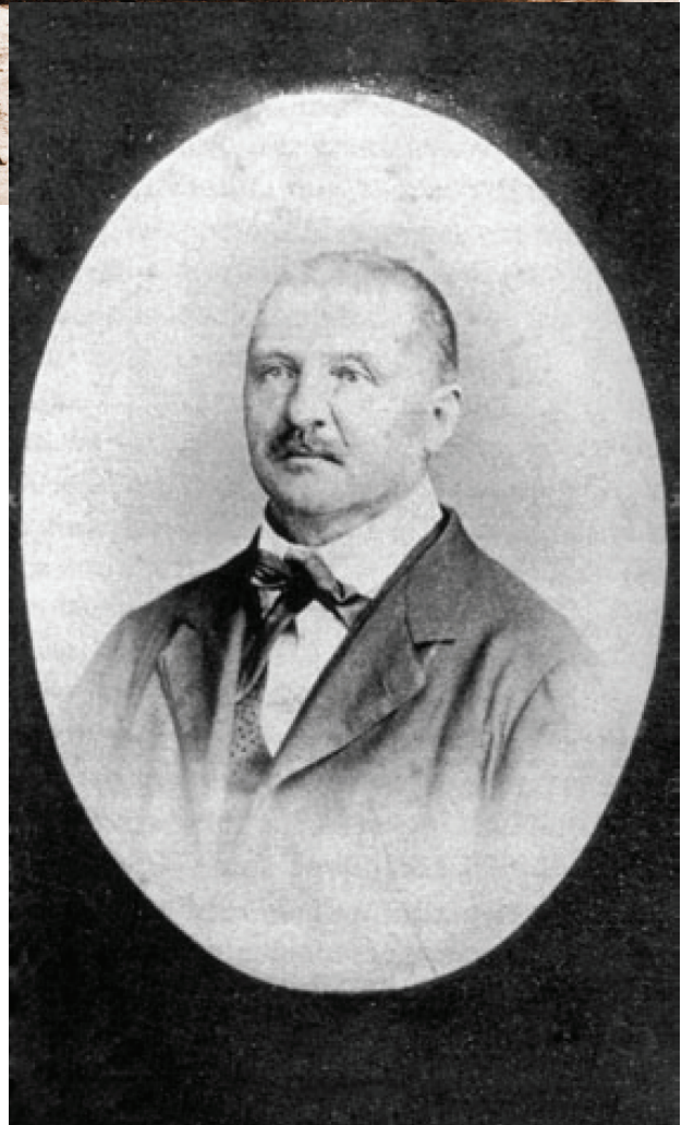
A slightly different pose of Bruckner