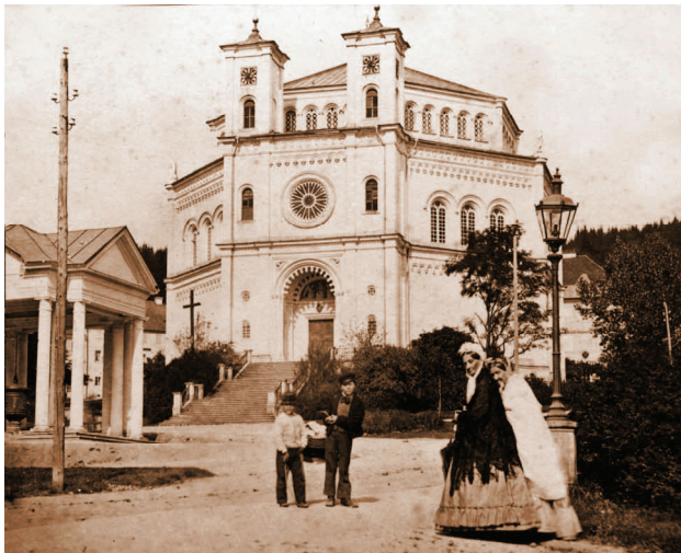
Marienbad (1872) - Catholic Church and the Imperial and Royal Post-Office, near the Hotel Weimar