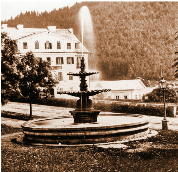
1872 - Marienbad : The fountain on Kirchenplatz.