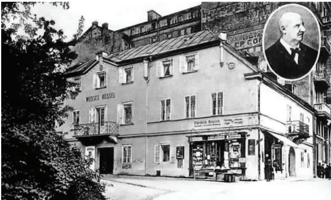
The White Horse Inn in Marienbad

But during the Summer of 1873, a serious cholera epidemic eventually drives Anton Bruckner out of Vienna.