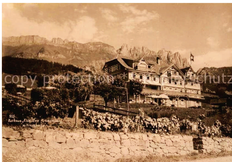
The Bath House in Kreuzberg