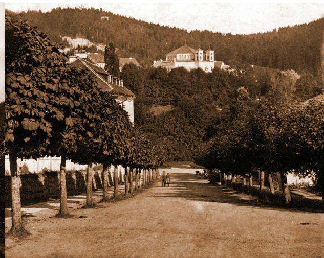
Jägerstraße, The Street of the Hunters and, in the background, the Catholic Church.