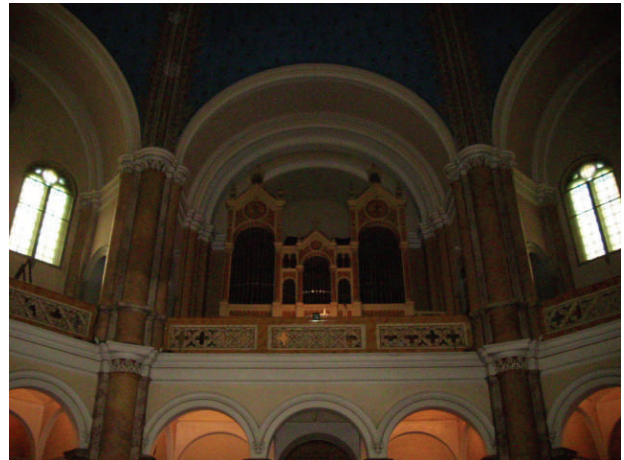
The Organ at the Dekanatskirche Mariä Himmelfahrt

Bruckner took time to play the organ at the Roman Catholic Church of the Ascension of the Virgin Mary (« Dekanatskirche Mariä Himmelfahrt ») located on the Stadtplatz (today, the « Gøtheplatz » (Gøthovo náměstí)) .