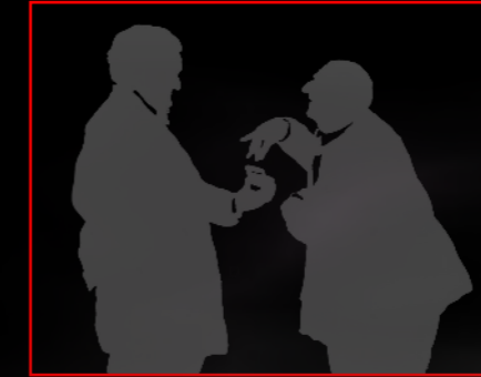
Richard Wagner and Anton Bruckner, at Wahnfried.