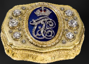
Imperial Snuff Box