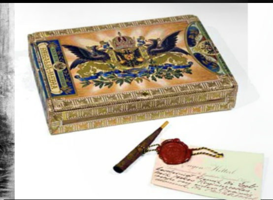
“Virginia” Cigar and Imperial Cigar Box